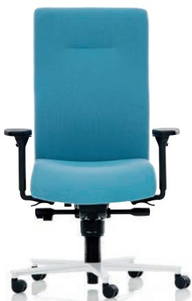
XP 4020 EB PLUS