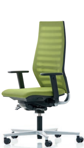
R12 6060 EB