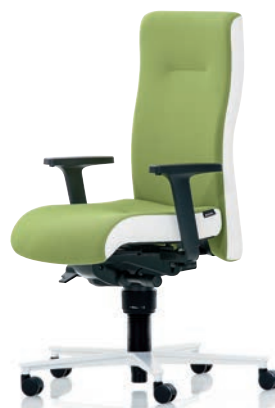
XP 4015 EB PLUS