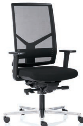
R14 3060 EB