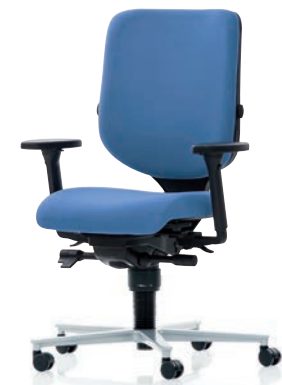
XT 3020 EB PLUS