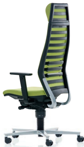
R12 6070 EB PLUS