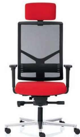
R14 3070 EB