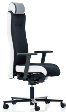
XP 4030 EB